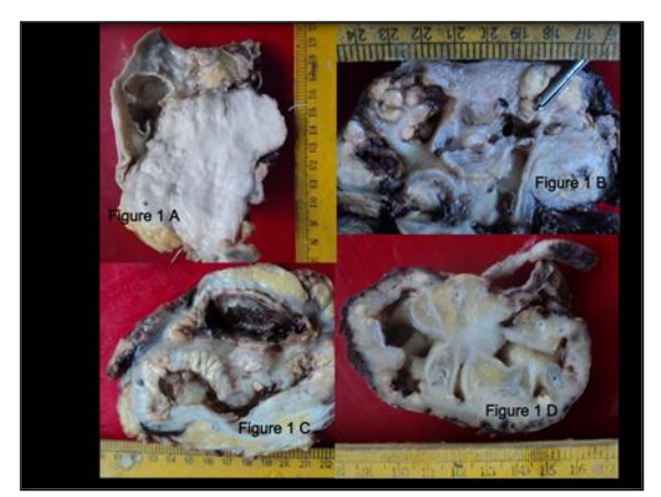
Figure 1: Showing gross features of XPN, note the loss of normal renal parenchyma

showed scanty remnants of Wilm's tumor (neoplastic tubules along with stroma) in the background of XPN.